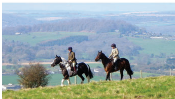
Fig.1: The Countryside Recreation Survey requested locations, routes or areas relating to a variety of recreational activities